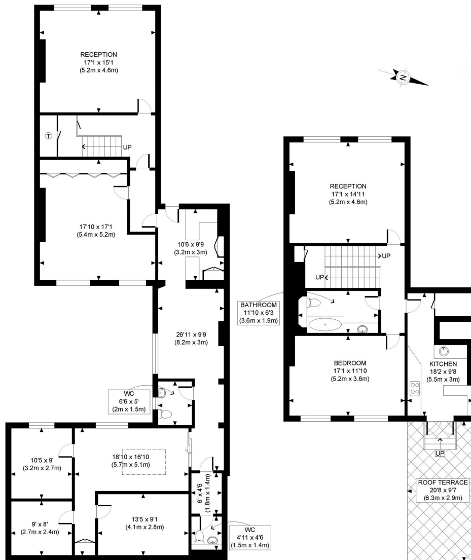
GROUND FLOOR GROSS INTERNAL FLOOR AREA 1591 SQ FT