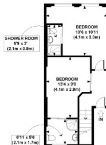
THIRD FLOOR GROSS INTERNAL FLOOR AREA 379 SQ FT

APPROX. GROSS INTERNAL FLOOR AREA 730 SQ FT / 68 SQ M MJCMB - 130119 Copyright photo-plan.co.uk Floorplans are for identification and guideline purposes only, not to scale. Compliant with RICS code of measuring practice.