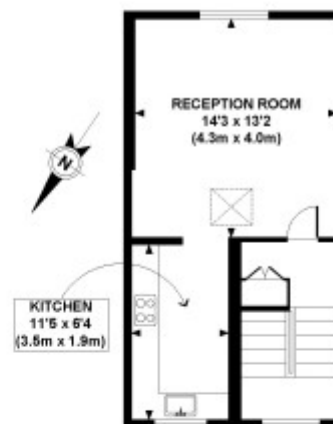
FOURTH FLOOR GROSS INTERNAL FLOOR AREA 351 SQ FT